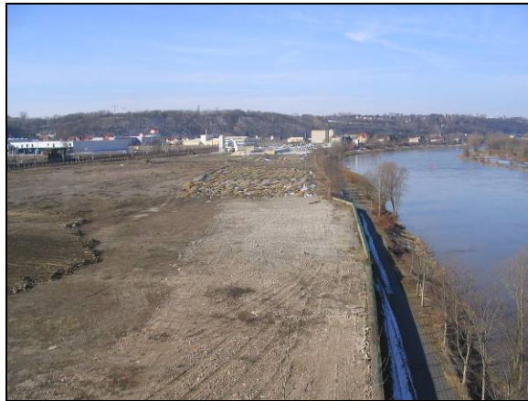
Location of brownfield directly at the Elbe