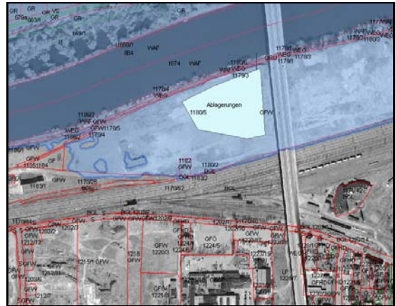
Location of brownfield in flooded area