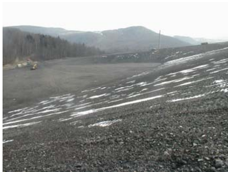
Dump assessment Schlema