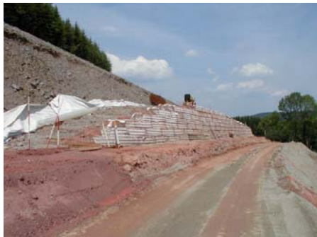
Reinforced soil construction central pit dump East slope Johangeorgenstadt