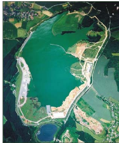
Tailings ponds Helmsdorf and Trünzig