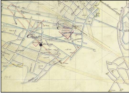
Extract from the mine layout plan pit Elvira, Lichterfeld

D-09117 Chemnitz • Jagdschänkenstraße 52 Tel.: +49 (0) 371 881 22 39 • Fax: +49 (0) 371 881 45 89 E-mail: info@cue-chemnitz.de Internet: www.cue-chemnitz.de