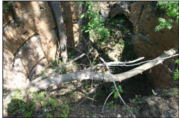
Shaft 3, pit Elvira